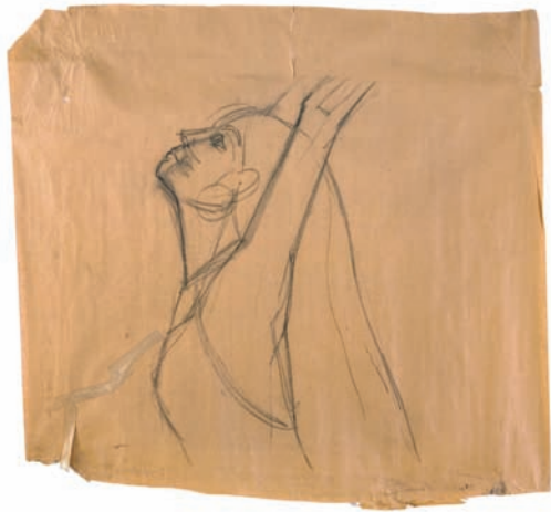
Pamela 3, 1983 graphite and charcoal on pounced brown paper 44-1/2" x 47-1/2" (113 cm x 120.6 cm) copyright Alex Katz/ Licensed by VAGA, NY, NY