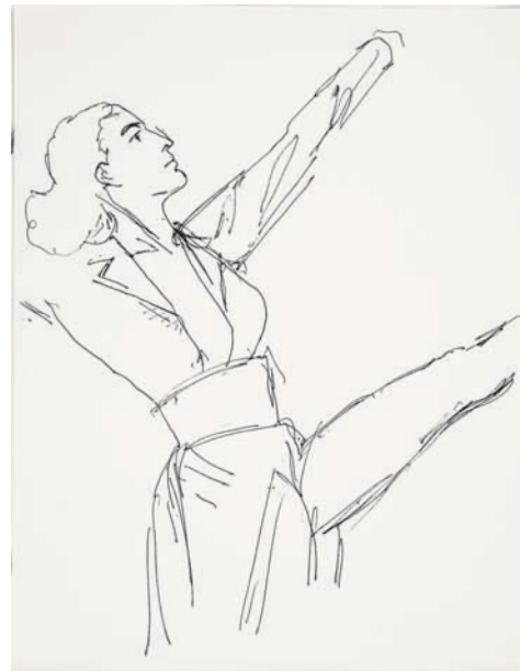
Paul Taylor Dance Co. Last Look 19, 1985 ink on paper 11" x 9" (27.9 cm x 22.9 cm) copyright Alex Katz/ Licensed by VAGA, NY, NY