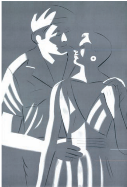
Sunset, 1984 lithograph on paper 70" x 47-1/2" (177.8 cm x 120.6 cm) Edition 5 of 41 Edition of 41 copyright Alex Katz/ Licensed by VAGA, NY, NY