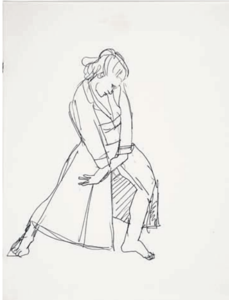
Paul Taylor Dance Co. Last Look 26, 1985 ink on paper 11" x 8-1/2" (27.9 cm x 21.6 cm) copyright Alex Katz/ Licensed by VAGA, NY, NY