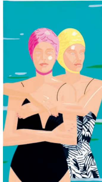
Eleuthera, 1999 Silkscreen, edition of 75 26 3/4 x 48 inches copyright Alex Katz/ Licensed by VAGA, NY, NY