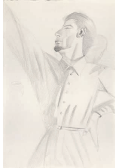
Study for Last Look 1, 1986 graphite on paper 22" x 15" (55.9 cm x 38.1 cm) copyright Alex Katz/ Licensed by VAGA, NY, NY